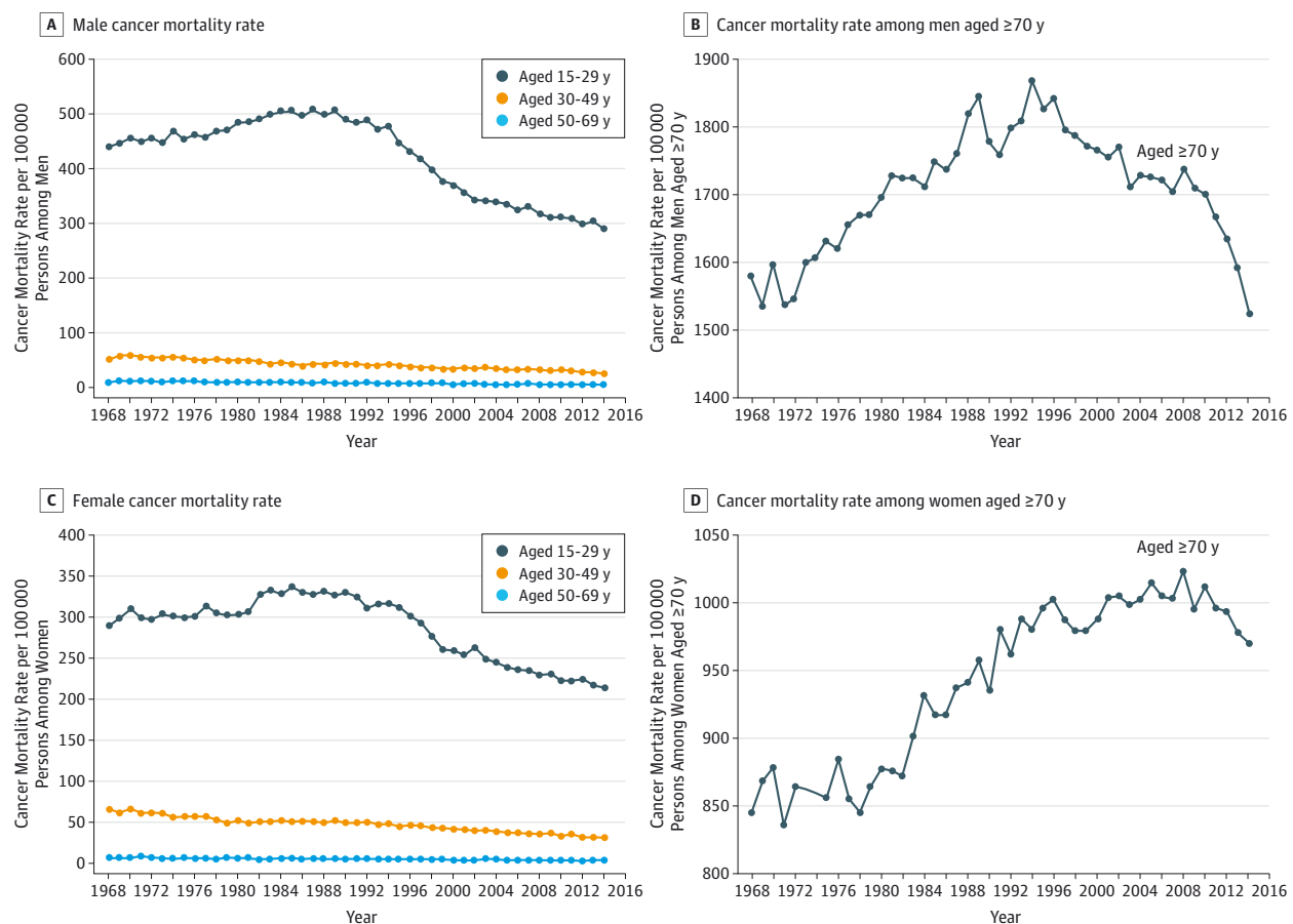
Figure 2. Trends of Age-Specific Cancer Mortality Rate Among Men and Women in Australia Between 1968 and 2014

A, Cancer mortality rate per 100 000 persons among men aged 15 to 29, 30 to 49, and 50 to 69 years in Australia between 1968 and 2014. B, Cancer mortality rate per 100 000 persons among men 70 years and older in Australia between 1968 and 2014. C, Cancer mortality rate per 100 000 persons among women aged 15 to 29, 30 to 49,